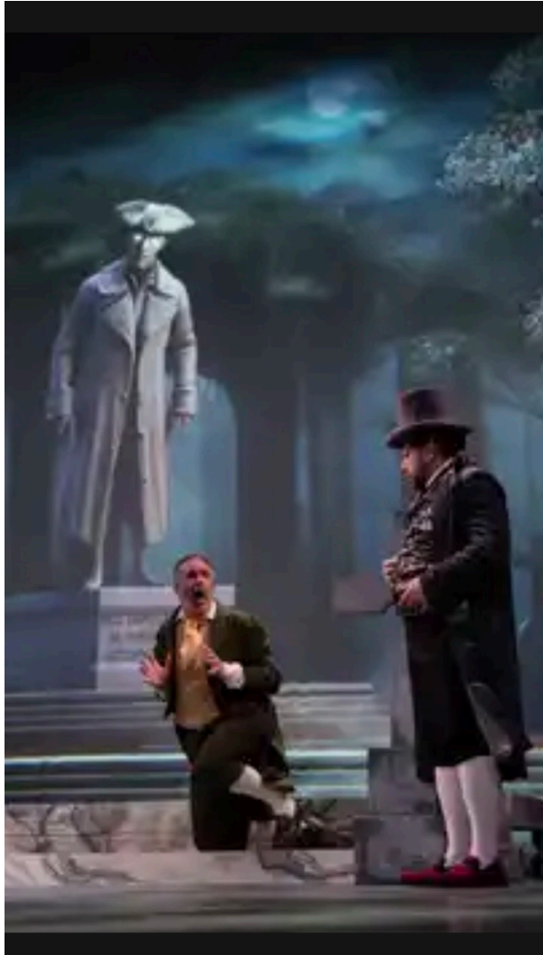
Don Giovanni with COSA, the Hamilton Philharmonic Orchestra, and the Bravo Academy of Performing Arts

COSA extends its ACCESS to the sound tracks of ancient action heroes. Marvel in the time travel. Beam past archaic themes to your vivid present. Ask yourself, What's changed? Is it "built different?" Soak it up. See what is unhinged and feral. Sense what gets in your feels; it is all rizzed up. It is... Early Music Magic!