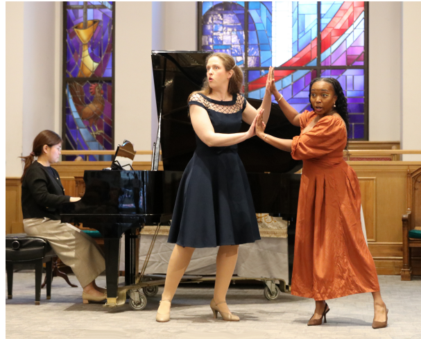
Arias After Work!

Watch for COSA's creative artists and their brilliant, self-themed shows: They will amaze you, and you will remember!